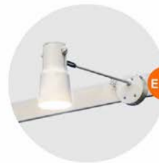
E-02 長臂射燈 (白色) Long-arm Spotlight (White) 23W