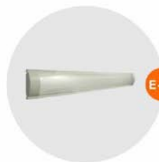
E-03 光管 Fluorescent Tube 28W