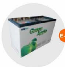
E-11 座地冷凍冰箱 (-18度)(不包括電插座) Sitting Style Refrigerator (-18°C, Excluding Socket) 1.28M(W)x0.57M(D)