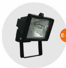
E-05 泛光燈(小太陽) Halogen floodlight 500W