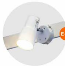
E-01 射燈 (白色) Spotlight (White) 23W