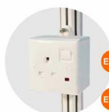
E-12 插座(不能用於照明用電) Single Phase Socket (for machine only) 1000W(220V)