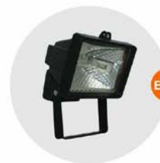
E-04 泛光燈(小太陽) Halogen floodlight 300W