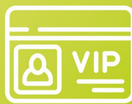
Hosted Buyer Programme