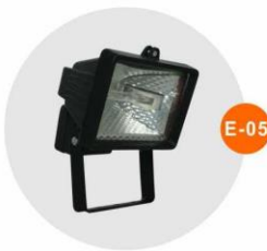
E-05 泛光燈(小太陽) Halogen floodlight 500W