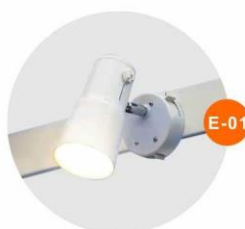
E-01 射燈 (白色) Spotlight (White) 23W