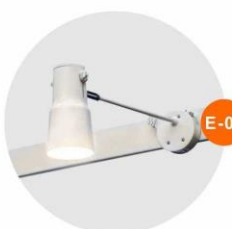
E-02 長臂射燈 (白色) Long-arm Spotlight (White) 23W