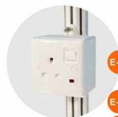
E-12 插座(不能用於照明用電) Single Phase Socket (for machine only) 1000W(220V)