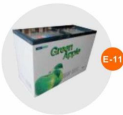
E-11 座地冷凍冰箱 (-18度)(不包括電插座) Sitting Style Refrigerator (-18°c, Excluding Socket) 1.28M(W)x0.57M(D)