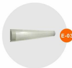
E-03 光管 Fluorescent Tube 28W