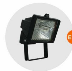
E-04 泛光燈(小太陽) Halogen floodlight 300W