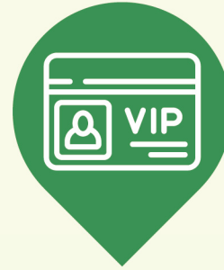
Hosted Buyer Programmes