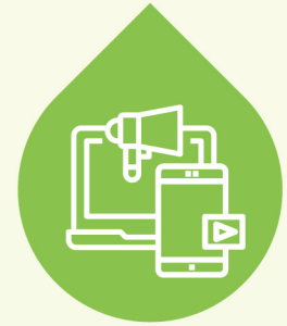
Extensive Promotion Opportunities