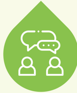
Seminars & Presentations