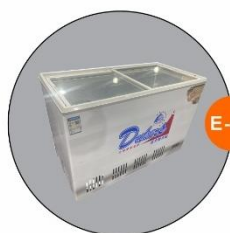
E-11 座地冷凍冰箱(-18度) (不包括電插座) Chest Freezer(-18°C) (Excluding Socket)