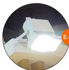
E-05 泛光燈(小太陽) Halogen floodlight 500W