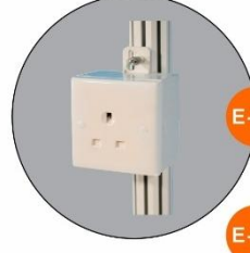
E-12 插座(不能用於照明用電) Single Phase Socket (for machine only) 1000W(220V)