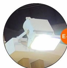
E-04 泛光燈(小太陽) Halogen floodlight 300W