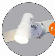
E-01 射燈(白色) Spotlight (White) 23W