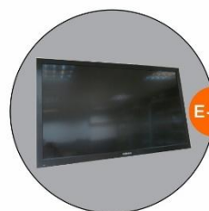
E-10 43"電視機 (不包括電源插座) 43" TV (Excluding Socket)